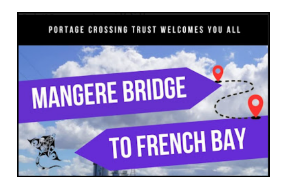
MAP - 8km Course